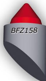
Dimensions: d=20 X 34mm

More multi-purpose weld-on teeth available on request