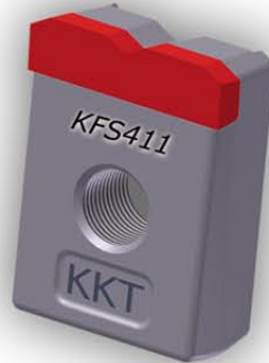
RAKER solid carbide