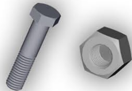
Hardware also available