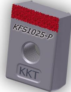
RAKER with carbide hardfacing