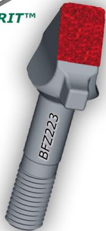
CARBIDE HARDFACED CUTTER