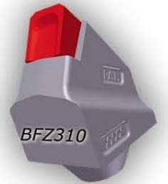
PLANER CARBIDE CUTTER