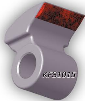
free-swinging hammers for shaft diameter 30mm