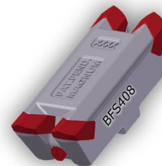
double-sided carbide tooth