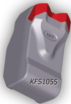
NEW fixed hammer for Seppi forestry mulchers (single bolt M16 fine thread)