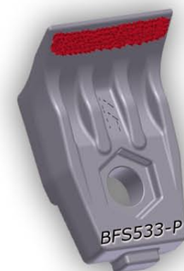
standard tooth with carbide hardfacing