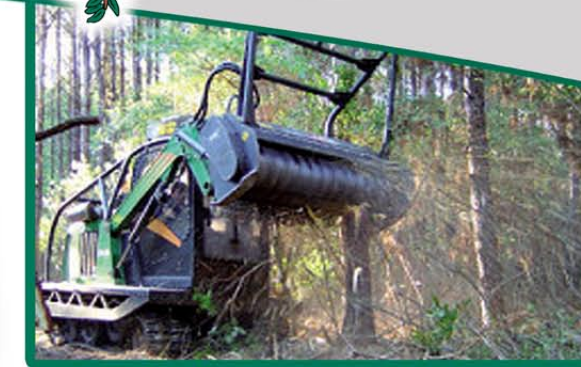
for Gyro-Trac / Denis Cimaf