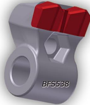
fixed hammers for Seppi forestry mulchers