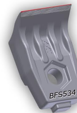
standard tooth fully sharpened out of the box