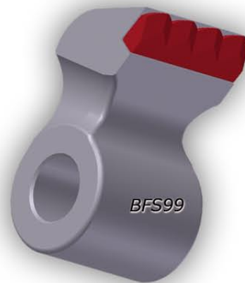
free-swinging hammer for shaft diameter 35mm