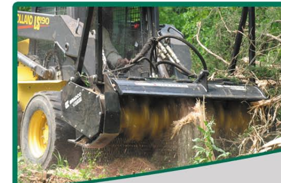
for Bradco / Magnum