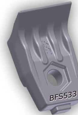
standard tooth hardened high-quality steel