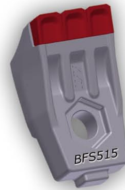
teeth with solid tungsten carbide