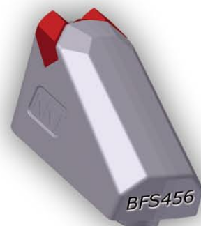
double bolt tooth (M16 fine thread) standard version