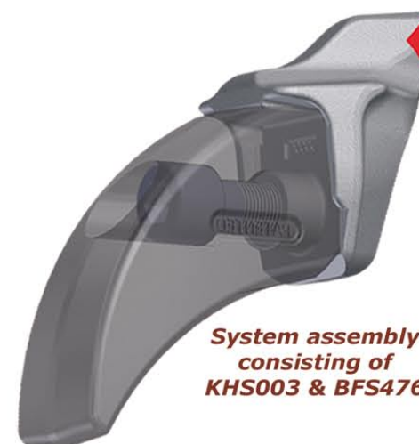
System assembly consisting of KHS003 & BFS476