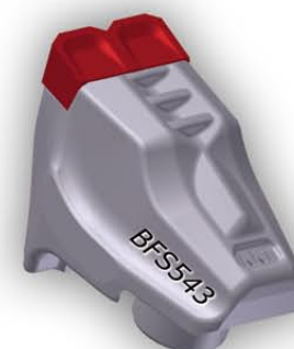
single bolt tooth (M20 fine thread) with innovative planer carbide