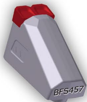
double bolt tooth (M16 fine thread) with innovative planer carbide