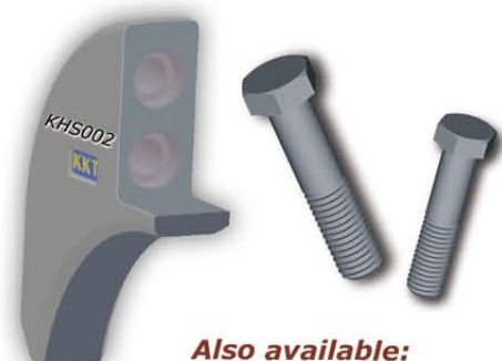
Also available: corresponding hardware and holders