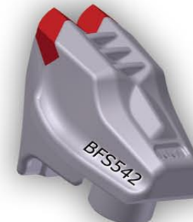
single bolt tooth (M20 fine thread) standard version