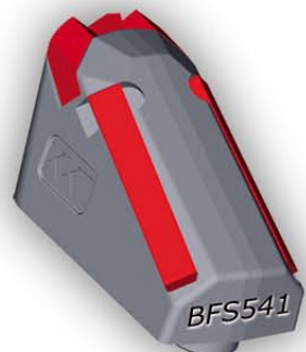
double bolt tooth (M16 fine thread) heavy duty version with additional carbide protection