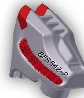
single bolt tooth (M20 fine thread) with carbide hardfacing