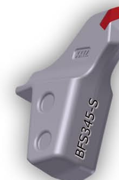
double bolt tooth (M16 fine thread)