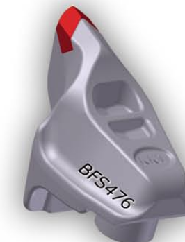
single bolt tooth (M24 fine thread)